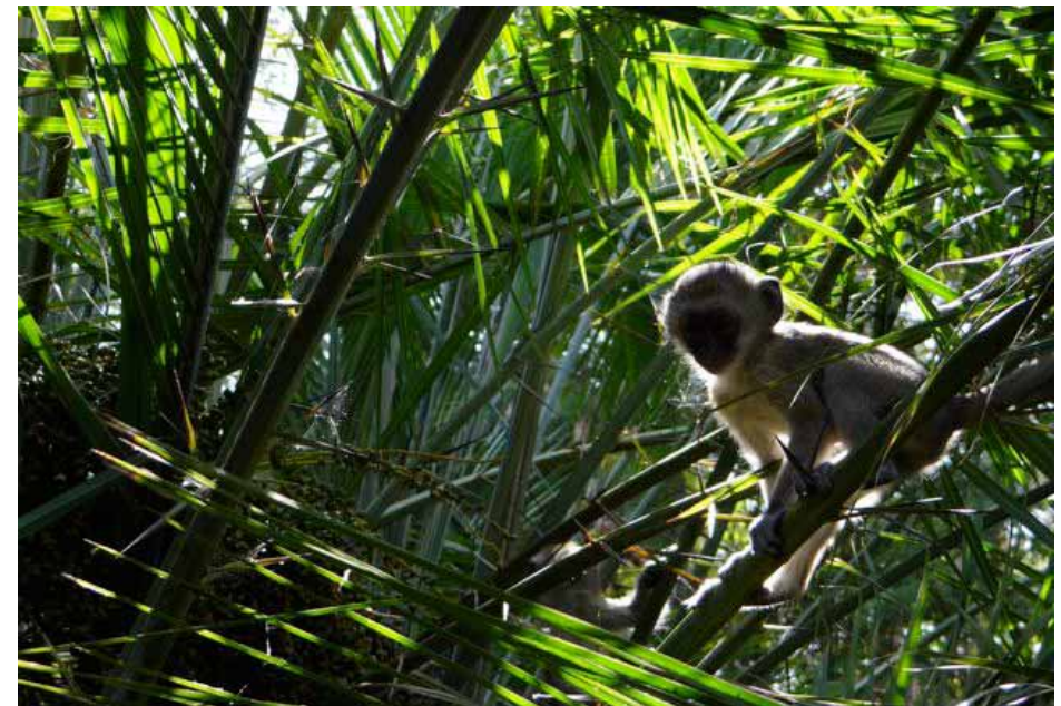
A baby vervet monkey scavenges for food in the garden at Ol Tukai.

Our way back to Nairobi was a lonely one, since everyone had been scattered around the park and left through various gates. Nevertheless, we managed to get home safely. We're now looking forward to our next trip with the museum society.