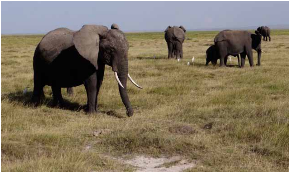
Elephants and egrets near the lodge