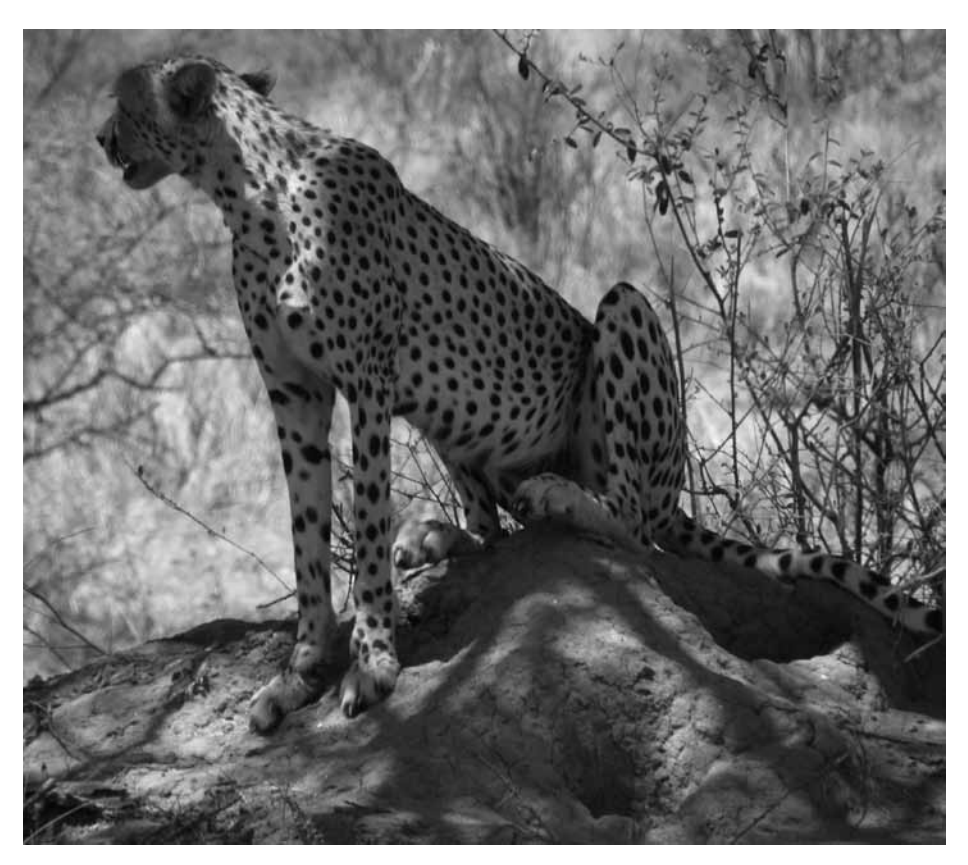
The magnificent cheetah stayed in view for some fine photos

meals, and the ambience were outstanding. Our twenty participants filled all ten tents. Some of us did game drives in the mornings and walks in the afternoons. Some did game drives and lounged by the pool in the afternoon. Many napped during the heat of the day.