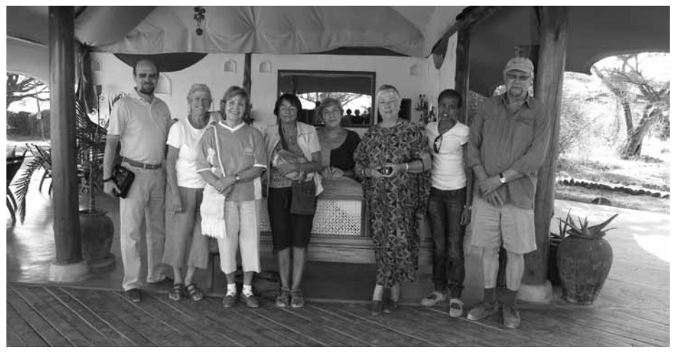
The KMS safari-goers