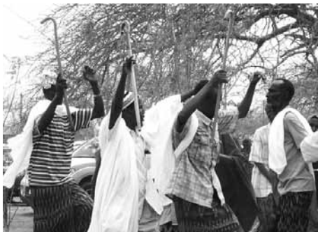
Gabbra people dance at the opening.

NMK Coordinator of Public Programming for Central