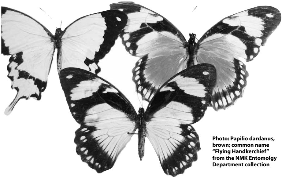
Photo: Papilio dardanus , brown; common name "Flying Handkerchief" from the NMK Entomology Department collection